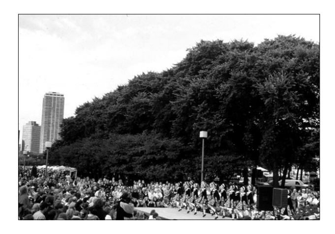
3. Irish American dancers at Celtic Fest Chicago.

musical shows (such as Riverdance and Celtic Tiger ), and a host of other venues. A recent program on American PBS television called "Celtic Woman" featured singers from Ireland performing an eclectic range of pop music that was linked mostly by the New Age "Celtic" style in which it was rendered. Innumerable Irish pubs, with names such as "The Mystic Celt" and "Celtic Connections" (both examples from Chicago), have sprung up in cities around the world, and these frequently